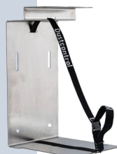
Ceiling Mounting AC600 (46433)