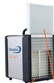
Pre-Filter G4 (46395)