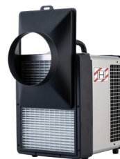
Funnel Connection D200 AC600 (46429)