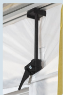
One-hand Ceiling Support (46358)