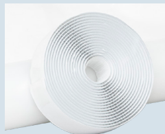
Adhesive Sealing (46359)